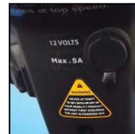
Handy 12 volt socket