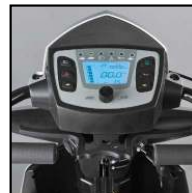
Digital LCD dashboard display