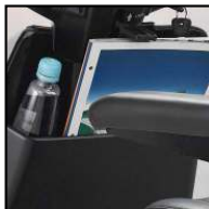
More space for storage