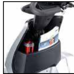
More space for storage