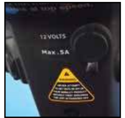
Handy 12 volt socket