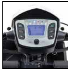
Digital LCD dashboard display