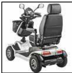
Modern LED lighting system