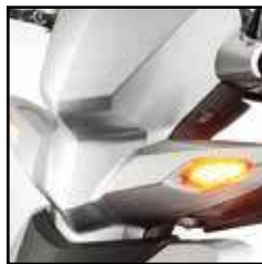
Modern LED lighting system