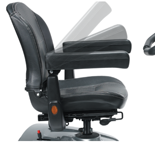
Swivel functionality and sliding rails ensure optimal seating position.