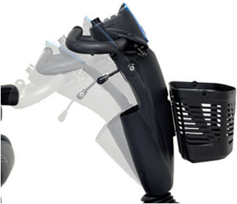
Users can easily adjust the tiller with a lever to suit their needs.

With exactingly high standards of design and safety engineering, the Leo undoubtedly sets a new market standard.