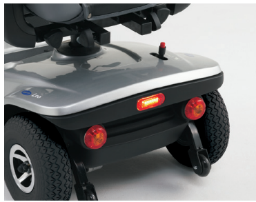
Rear brake lighting warns other people that the scooter is slowing down, thus preventing collisions.