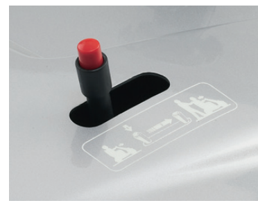
This unique two-step disengaging lever prevents the scooter from accidentally freewheeling.